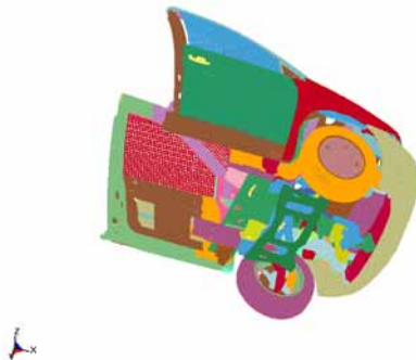
Fig.1 Model I