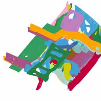
Fig.2: Model II

At first, contact definition C-3 is defined by engine and surrounding parts as shown in Fig.1. For 32CPU, the calculation cost of this contact is 1.3%, but for 128 CPU the calculation cost of the contact is 9.8% , since the element calculation and the other contact are speed-up. The elapse time of C-3 for 128CPU is longer than that for 32CPU, and the performance is not improved after 64CPU as shown in Fig.3 Model I.